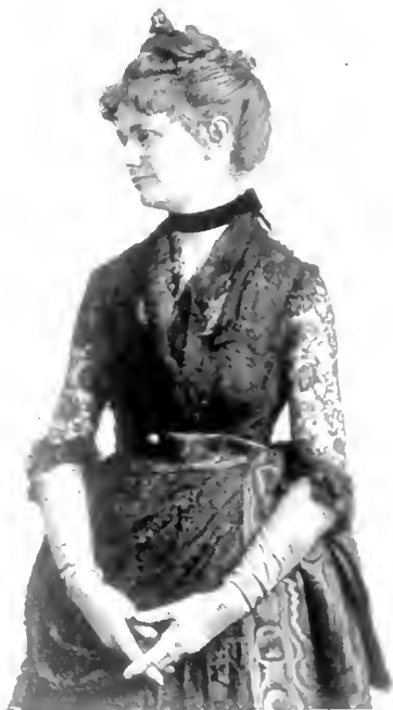
MABEL LOOMIS TODD.

TODD, Mrs. Mabel Loomis , author, born in Cambridge, Mass., 10th November, 1858. She is